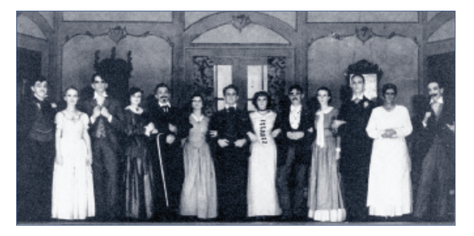
"Rose of the Southland," 1933