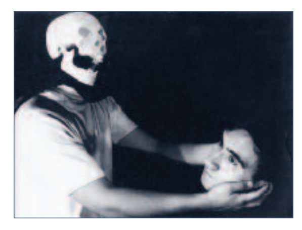
"Hello Hamlet" publicity photo, 1967

looking for an opportunity to direct, Glade hoped to establish a permanent theater program at Wiess that would last beyond his tenure at Rice. In the fall of 1965, the Wiess Tabletop Theater, so named for the use of the college's tables to provide elevation for audience seating, presented its first production, Sophocles' "Antigone," directed and produced almost single-handedly by Glade. After scrapping a spring production of "Six Characters in search of an