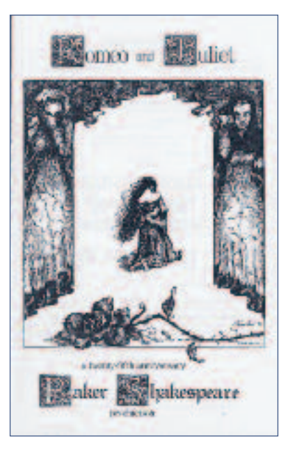
Program cover, "Romeo and Juliet," 1995

rom its beginning, Rice University has been seen as a school focused on the sciences and engineering, an elite training ground for its innovators and leaders of the natural and mechanical world, with a benign neglect towards the arts. Yet, it has almost always had theater. In spite of perceptions, Rice is home to both the oldest collegiate theater troupe and the longest-running annual Shakespeare festival in Houston, and it is a school that produces more plays in any given year than most surrounding universities that boast stronger, more firmly established theater departments. Though Rice was the last major university in Houston to establish a formal theater program and degree, the fierce dedication