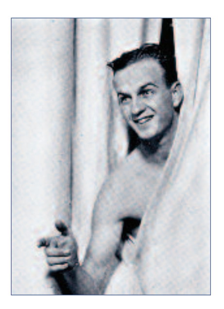
"Naked Boy," 1921