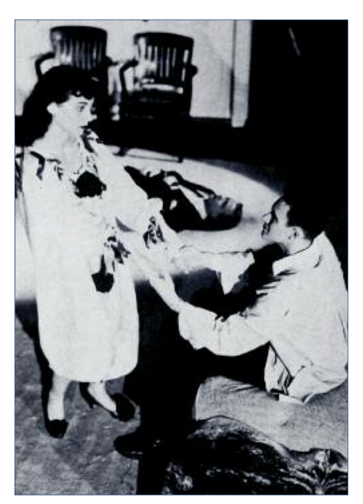
"Earth Spirit," 1955

With America's entrance into the Second World War in 1941, however, campus activities, including those of the Dramatics Club, were halted, leading to the decline and eventual end of the theater group. Even with the end of the war in 1945, the Dramatics Club did not immediately reappear, with students waiting until the spring of 1947 to reorganize. Despite the years of dormancy, the club quickly rebuilt itself and gained prominence on campus once