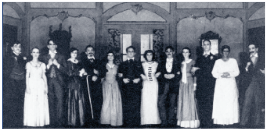
"Rose of the Southland," 1933