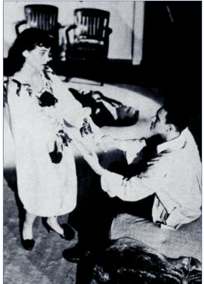
“Earth Spirit,” 1955

With America’s entrance into the Second World War in 1941, however, campus activities, including those of the Dramatics Club, were halted, leading to the decline and eventual end of the theater group. Even with the end of the war in 1945, the Dramatics Club did not immediately reappear, with students waiting until the spring of 1947 to reorganize. Despite the years of dormancy, the club quickly rebuilt itself and gained prominence on campus once