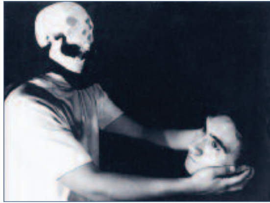
"Hello Hamlet" publicity photo, 1967

looking for an opportunity to direct, Glade hoped to establish a permanent theater program at Wiess that would last beyond his tenure at Rice. In the fall of 1965, the Wiess Tabletop Theater, so named for the use of the college's tables to provide elevation for audience seating, presented its first production, Sophocles' "Antigone," directed and produced almost single-handedly by Glade. After scrapping a spring production of "Six Characters in search of an