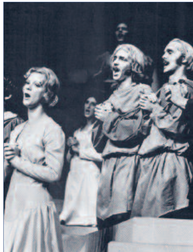
Rice Players, 1972