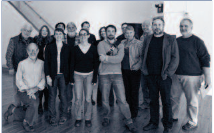
Faculty, Visual and Dramatic Arts, 2010