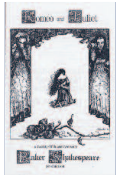
Program cover, "Romeo and Juliet," 1995

Rice theater finds its roots in the Dramatics Club, formed shortly after the conclusion of the First World War, which started the traditions that have remained a part of Rice's theatrical identity throughout its history. Though theater existed on campus before the rise of this new club, with an annual production by the Young Women's Christian Association following their first play, "Green Stockings," in 1918 and the occasional show by other groups on campus, the Rice Dramatics Club became the first organization solely focused on creating theater at Rice. With their preliminary plans laid out in 1921, the group premiered a festival of one-act plays at Autry House that fall, a successful production that gained the support of students and the greater Houston community. By 1923 the club was invited to perform for the Rice Alumni Association's annual reunion, an honor that "marked the first official recognition of the Dramatics Club as an important phase of Rice activities." Though