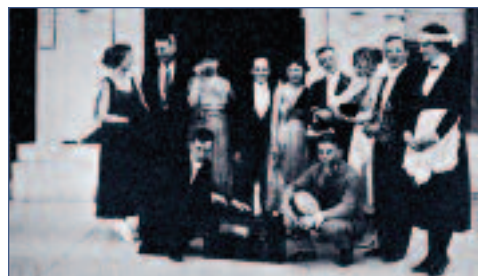
"Green Stockings," 1918