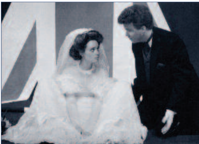
Smash Rice Players, 2001