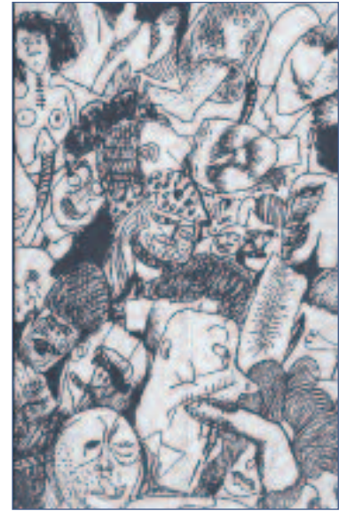
“Marat Sade” Program, 1969