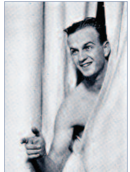
"Naked Boy," 1921