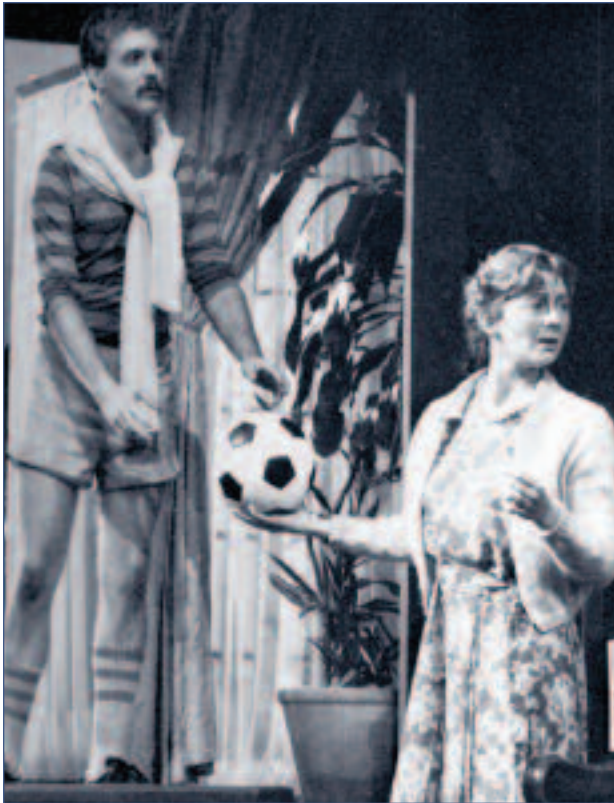
"Close of Play" by Simon Gray, 1982